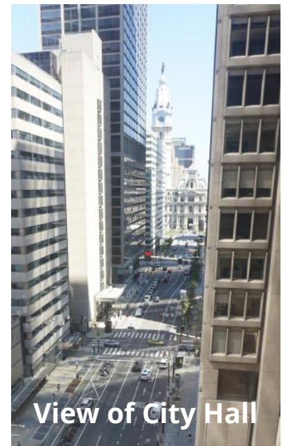
View of City Hall