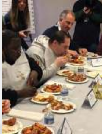
Water Ice & Soft Pretzels in the Summer