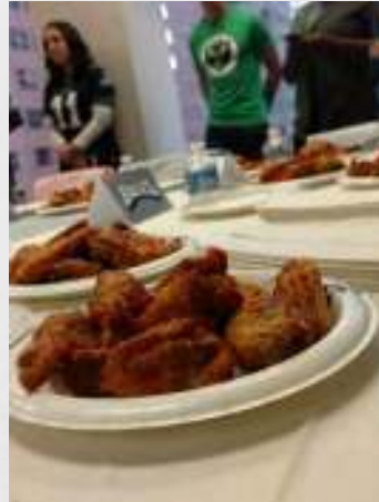
Harper's Garden Tenant Cocktail Party