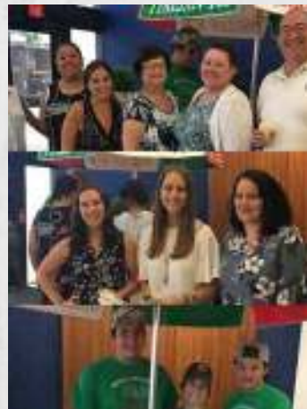
1760 Market Street Property Mgt Team