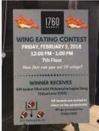
American Red Cross Blood Drive