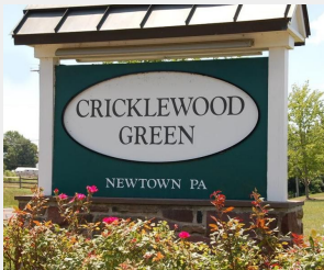
Cricklewood Green, Newtown, PA