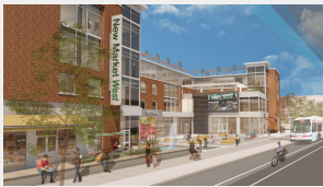
5901 Market Street, Philadelphia, PA