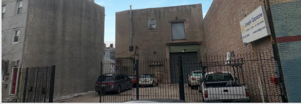
Frontage along E. Passyunk Ave. and S. Darien St.