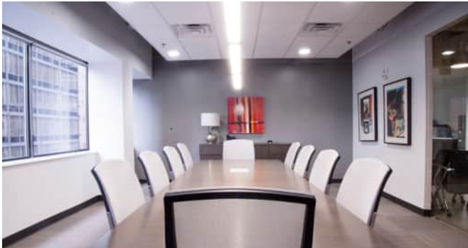
TENANT LOUNGE & CONFERENCE ROOM